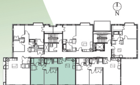
Building Floor Plan

HOLT ARCHITECTS 217 N. Aurora Street, Ithaca, NY 14850 p:607 273 7600 f:607 273 0475 http://www.holt.com