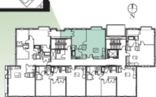
Building Floor Plan

HOLT ARCHITECTS 217 N. Aurora Street, Ithaca, NY 14850 607-273-7600 607-273-0475 http://www.holt.com