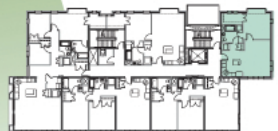
Building Floor Plan